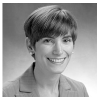
16 TH ANNUAL MELVIN D. SCHLOSS LECTURER