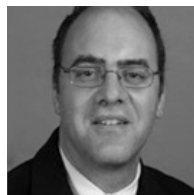
9 TH ANNUAL MCGILL OTOLARYNGOLOGY SCIENCES LABORATORY LECTURER